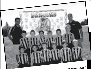
THE DRAGONS HOPE EVERYONE HAS A ROLLING GOOD TIME AT THE