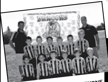
THE DRAGONS HOPE EVERYONE HAS A ROLLING GOOD TIME AT THE